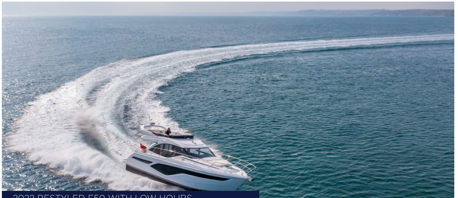
2022 RESTYLED F50 WITH LOW HOURS