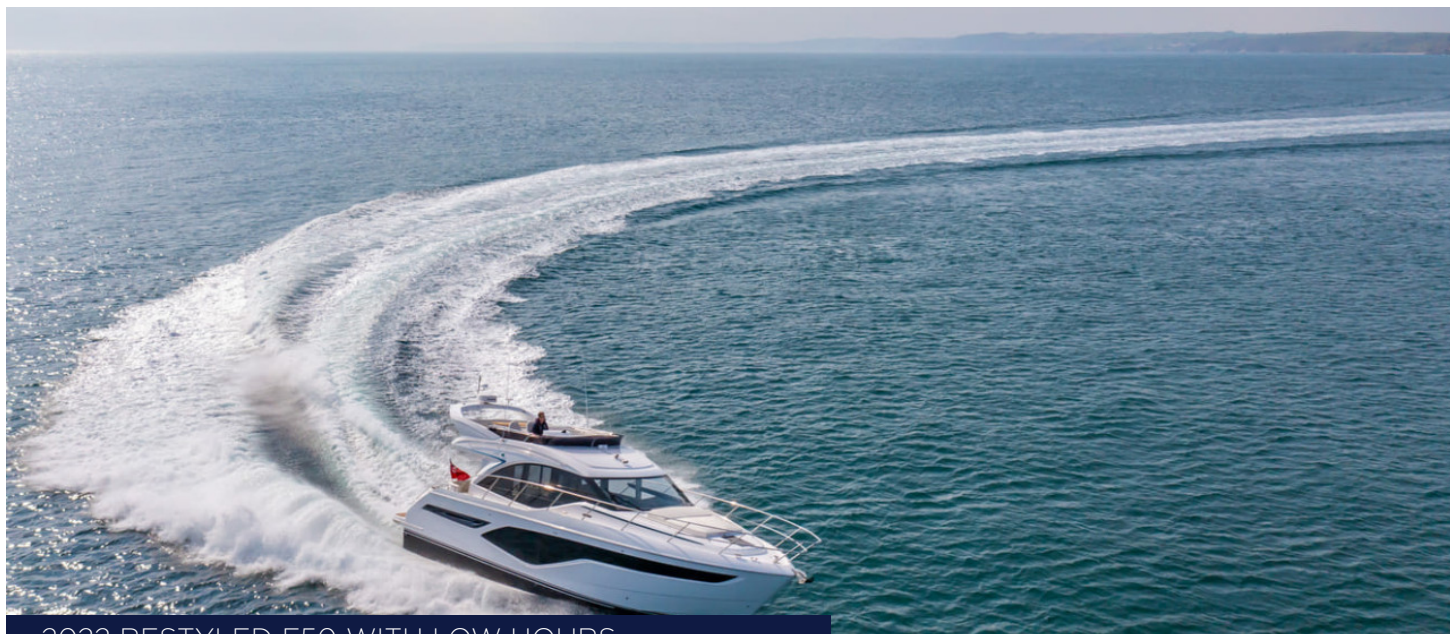
2022 RESTYLED F50 WITH LOW HOURS