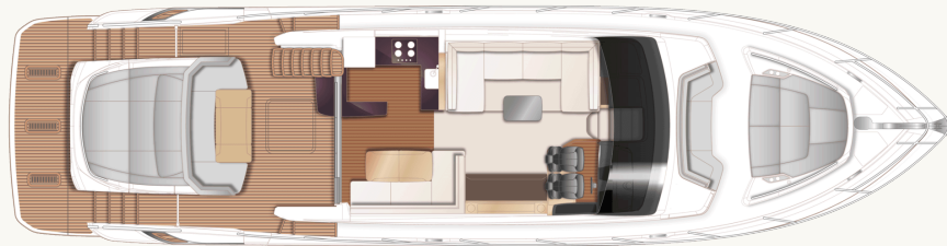
S62 Main Deck