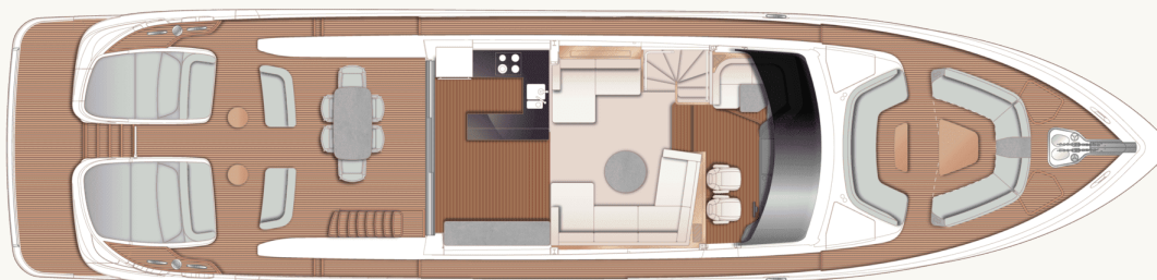
S80 Main Deck