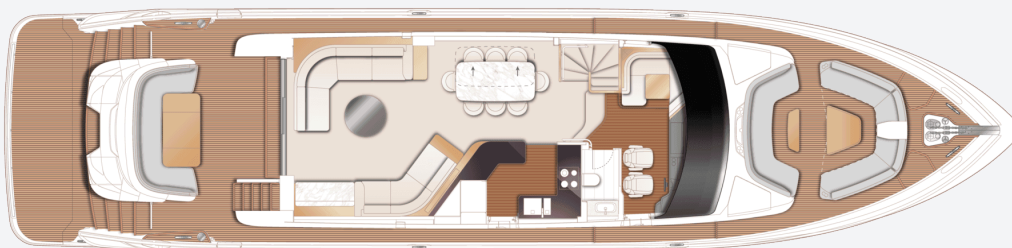
Y80 Main Deck