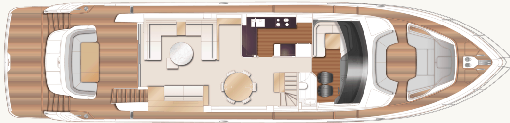
Y85 Main Deck